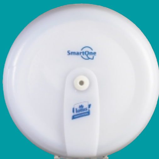
SMARTONE IS AVAILABLE IN BLUE OR WHITE

Paper is fully enclosed in the lockable, robust dispenser. However, should you wish to allow emergency access through the aperture, simply remove the locking clip which holds the cover in place.